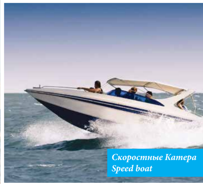
Скоростные Катера Speed boat