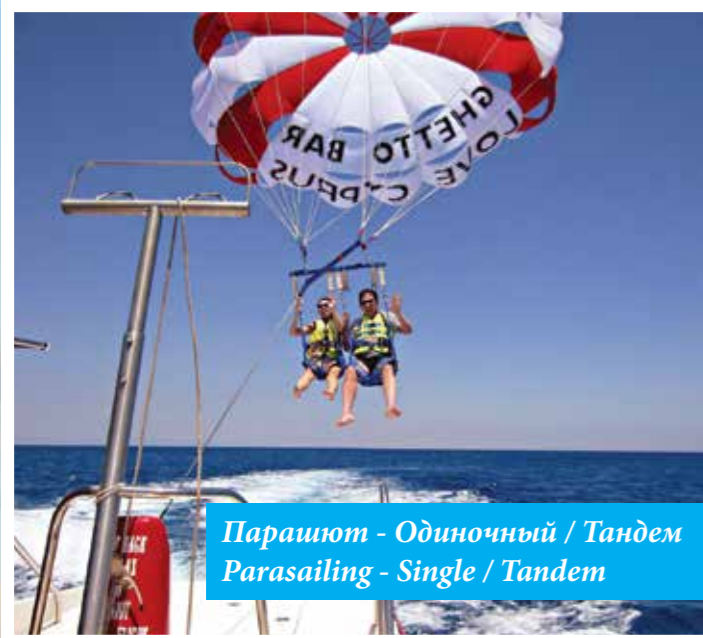
Параютом - Одиночный / Тандем Parasailing - Single / Tandem