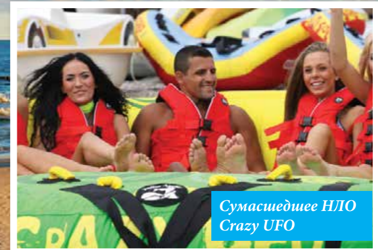
Сумасшедшее НЛО Crazy UFO

Предлагаем вам услуги профессиональных инструкторов • Lessons by professional instructors